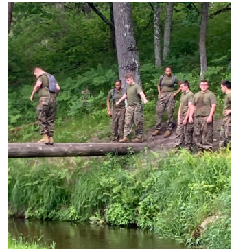
Cadets strategize how to cross a creek