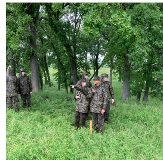
Cadets work as teams in land navigation