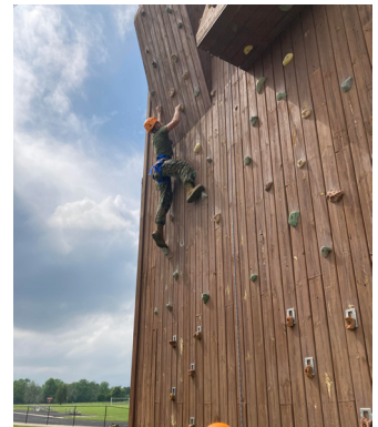
Cadets do the wall climb