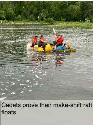
Cadets prove their make-shift raft floats