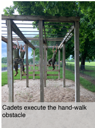
Cadets execute the hand-walk obstacle