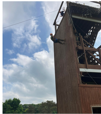
Cadets rappel off a 60' tower

the summer, starting with the MCHS graduation ceremony on June 12th. They will be conducting summer military drill sessions, with the objective to return to the National MCJROTC Championship in Washington, DC next Spring. This extra-curricular activity, like all MCJROTC events, are done at no cost to the student or MCHS. They are funded primarily through the Marine Corps, with augmentation coming from the MCJROTC Booster Club.