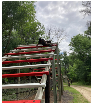
Cadet Lance Corporal & Cheyenne Fitzpatrick tackle the over and under obstacle