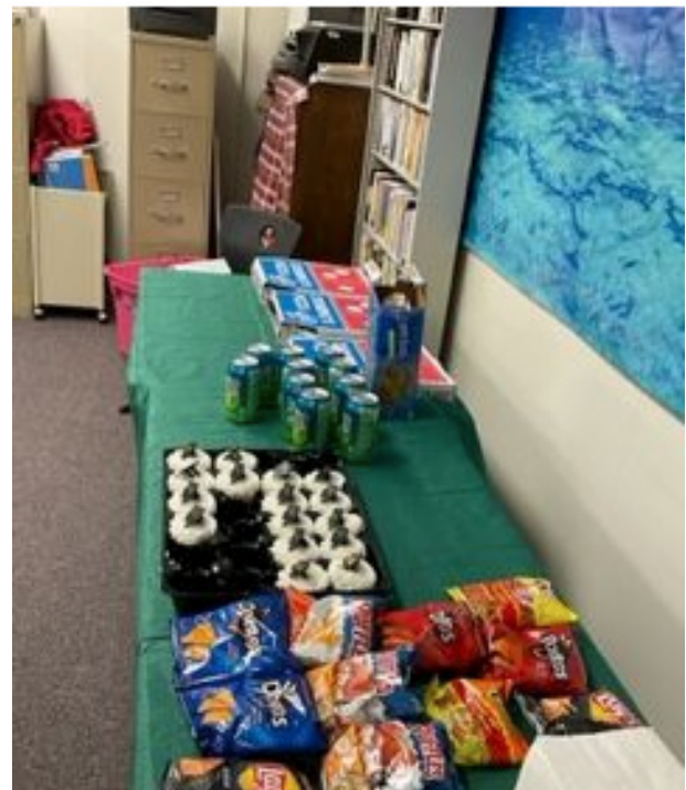
All of the students who help at the Student Store were celebrated with a party.